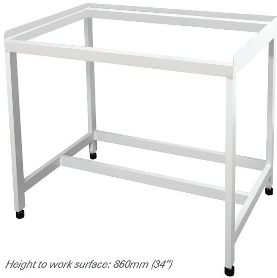
Height to work surface: 860mm (34")

To make your cabinet freestanding, you may choose to purchase an open box section support stand with adjustable/levelling feet. A motorised height adjustable version is available.