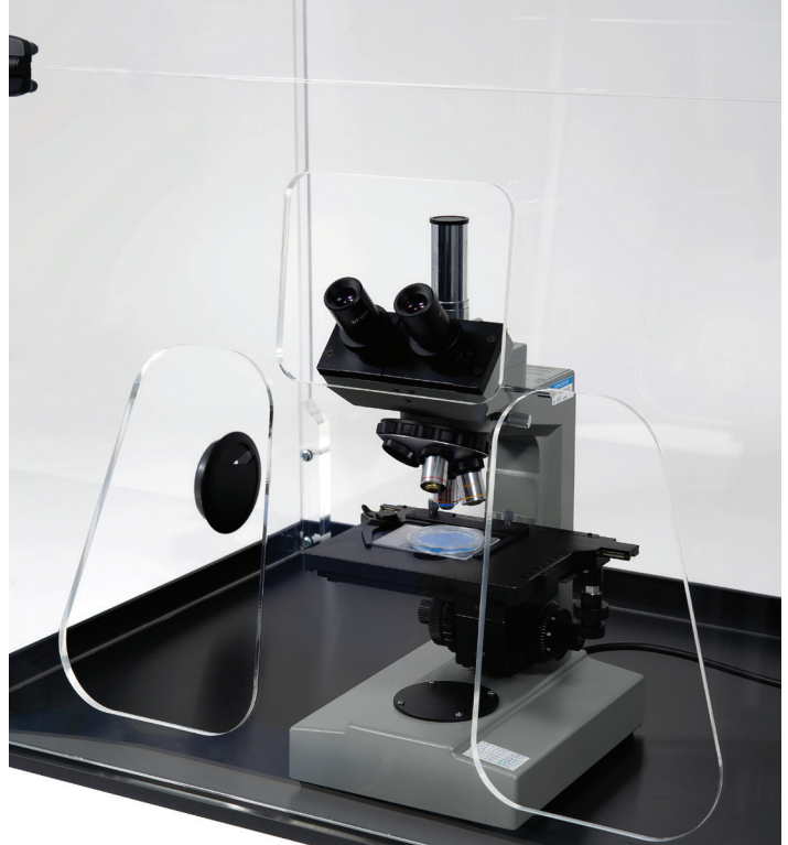
Detail of acrylic, showing services port in side panel.

LED – Low Energy Lighting. Carbon Solvent filter upgrade.